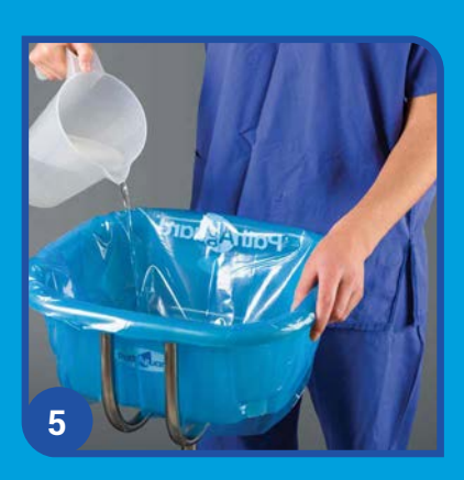
Fill ABLiS with liquid to required level.

PRODUCT CODE CMCBC10001A: PathAguard ABLiS Basin Carrier