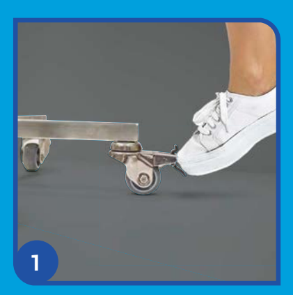
Before placing ABLiS in ABLiS Basin Carrier make certain that the wheel locking mechanism is applied