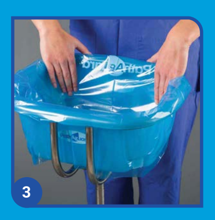
Holding ABLiS firmly at both ends, place ABLiS in ABLiS Basin Carrier.