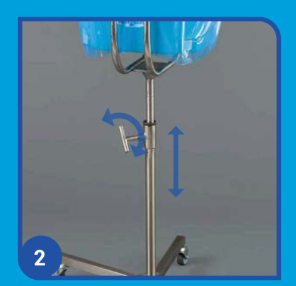
Make sure that correct height adjustment is completed before moving