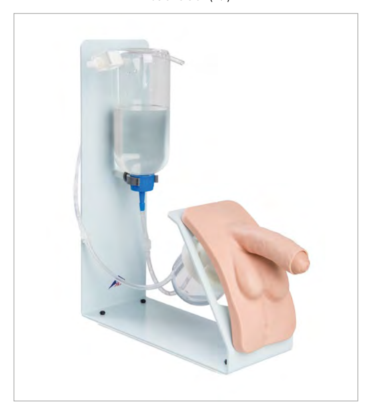
Basic version (m/f)