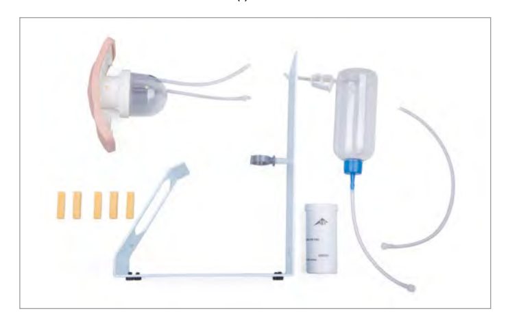
Basic (f) 1020231