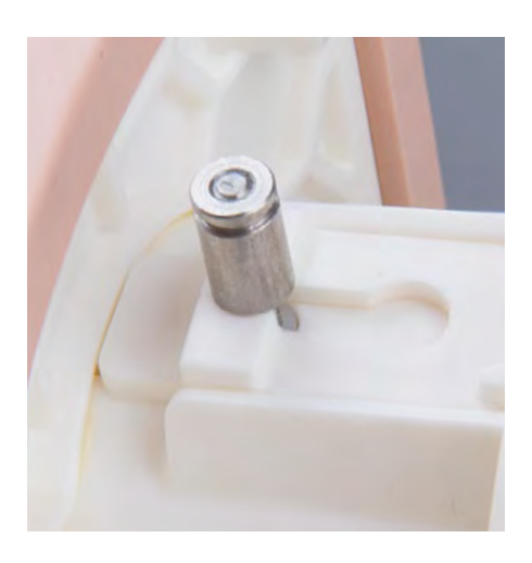
3 levels of urethral constriction "Open" - "Partial constriction" - "Full constriction"