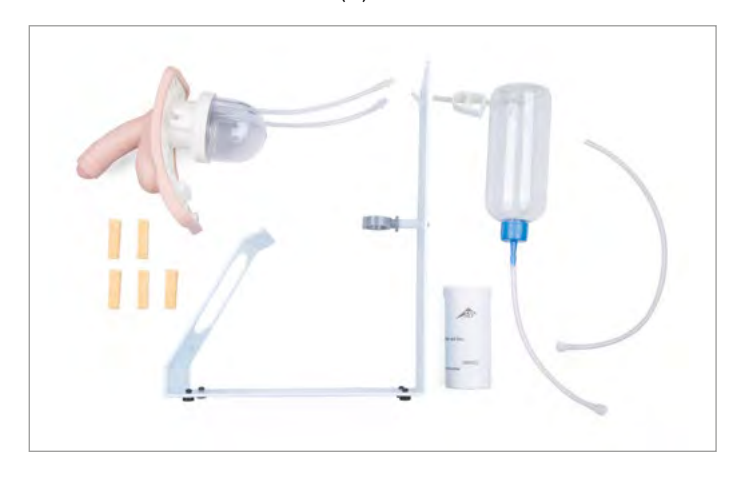
Basic (m) 1020232