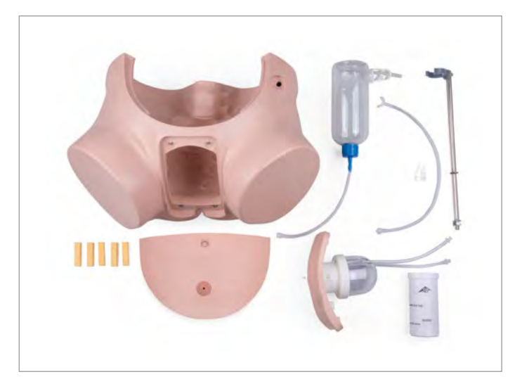
PRO (f) 1023008