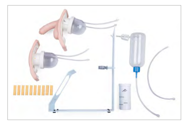
Basic (s) 1020842