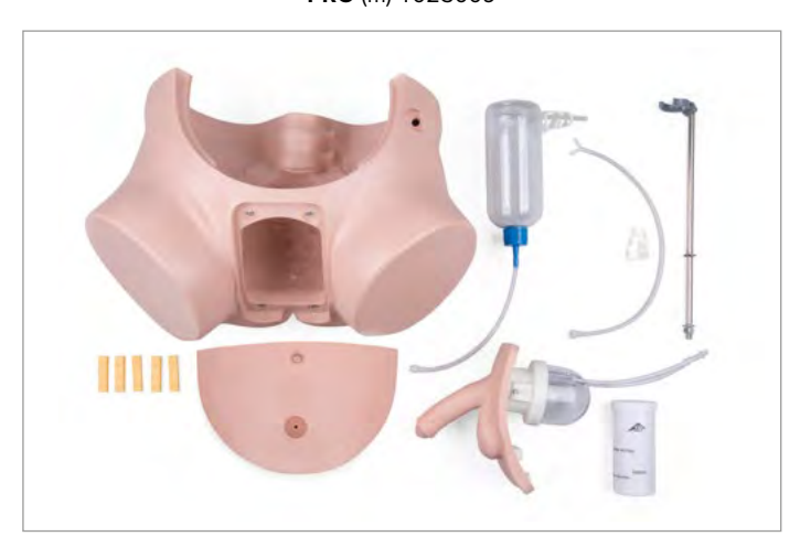
PRO (m) 1023009