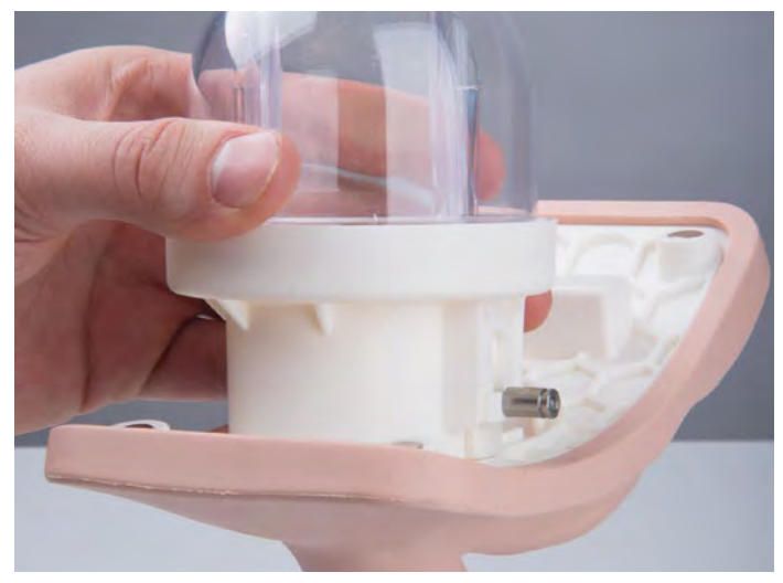
Metal pin and adjustment slide