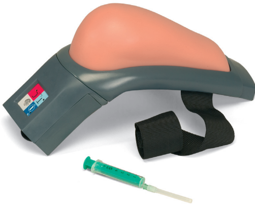
Also available from 3B Scientific®: 1009840 Intramuscular injection simulator, upper arm