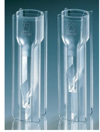
BRAND ultra-micro UV-Cuvettes. 8.5mm (left) and 15mm (right) window heights