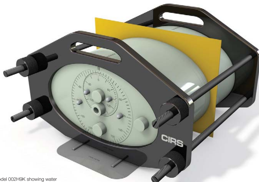
Model 002H9K showing water equivalent rod with ion cavity