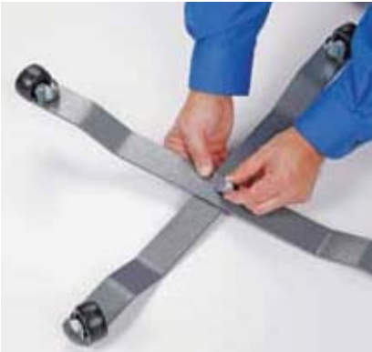
Step 3 – Insert bolt through both bases. Threads should be pointing up when base is upright.