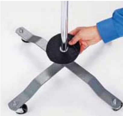
Step 5 – Slide friction disc over pole so it rests on the base.