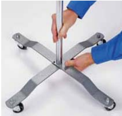
Step 4 – Screw either end of pole onto threaded end of bolt.