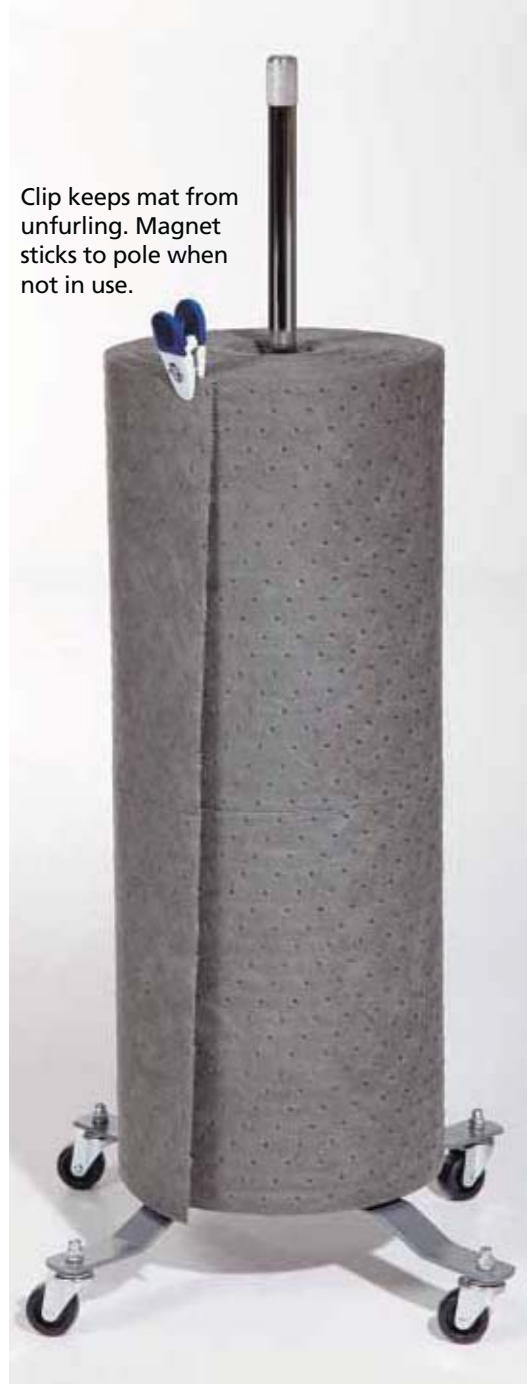
Step 7 – Load mat onto pole so it rests on the friction disc. Your PIG ® Mat is ready to roll!!