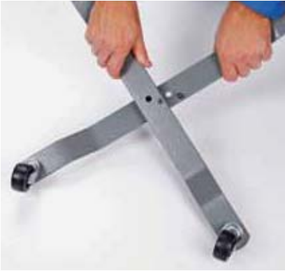
Step 1 – Cross bases to form an “X” with wheels facing up.