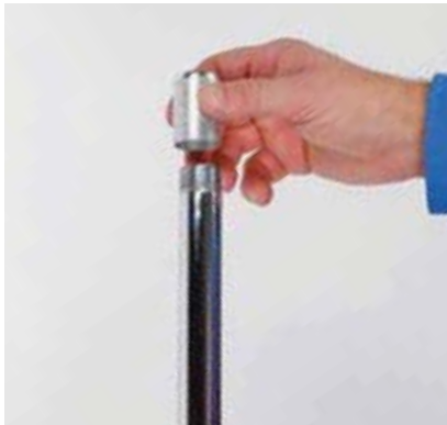
Step 6 – Screw connector onto top of pole for a finished look.