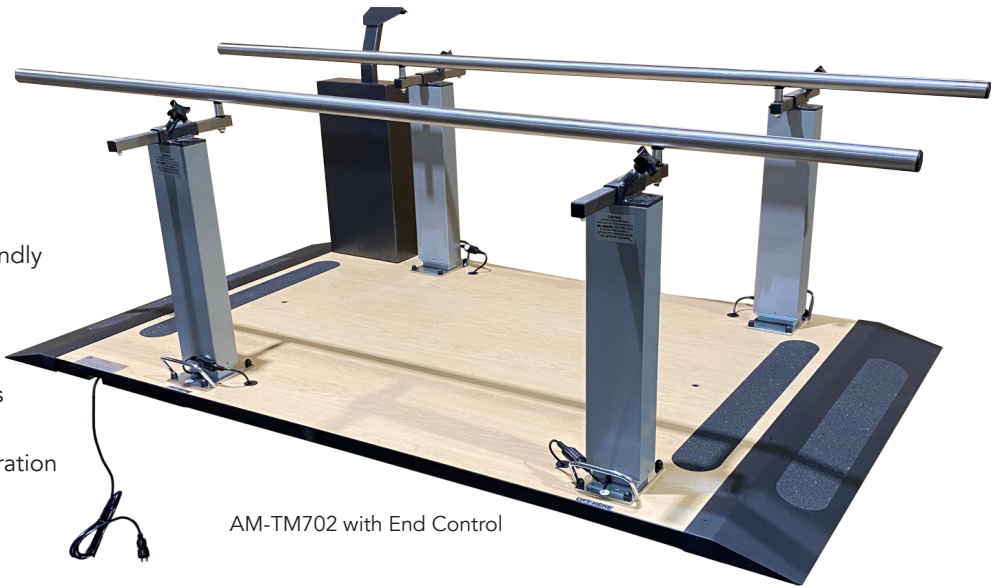
AM-TM702 with End Control