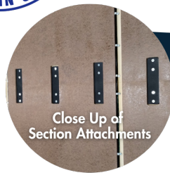
Close Up of Section Attachments