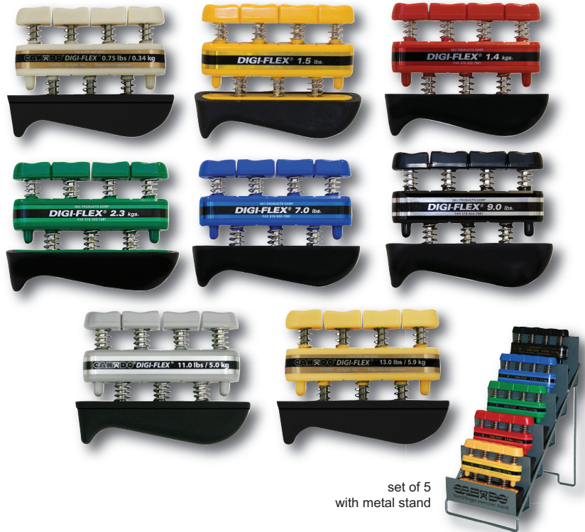
set of 5 with metal stand