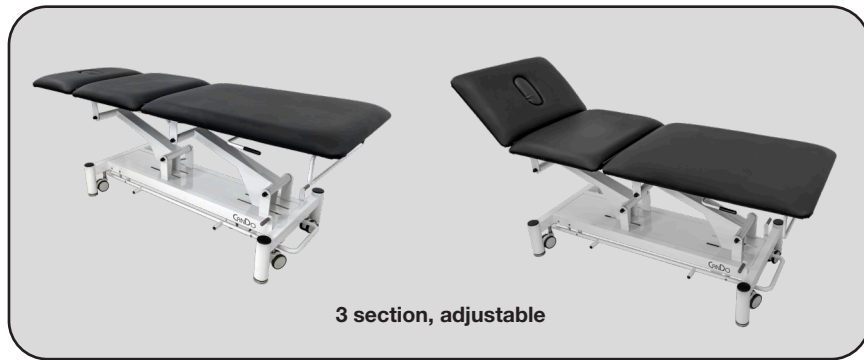
3 section, adjustable

CanDo® Hi-Lo Treatment Table, 3 Section, Black Vinyl Top, White Base, Nose Hole Cut Out