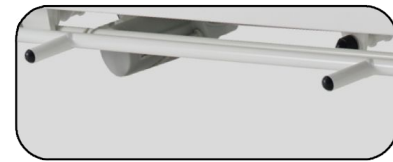
360° foot bar for table height adjustments