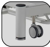
3" (7.6 cm) silent casters, adjustable feet