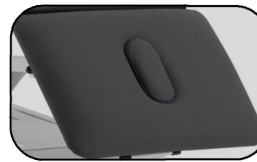
nose hole cut out