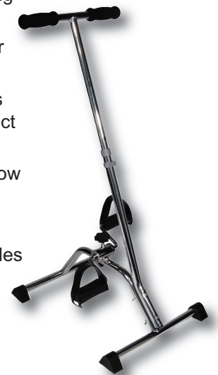
10-0713 exerciser w/ handle

10-0710 one piece construction 10-0711 KD (knocked down, 3 piece construction)