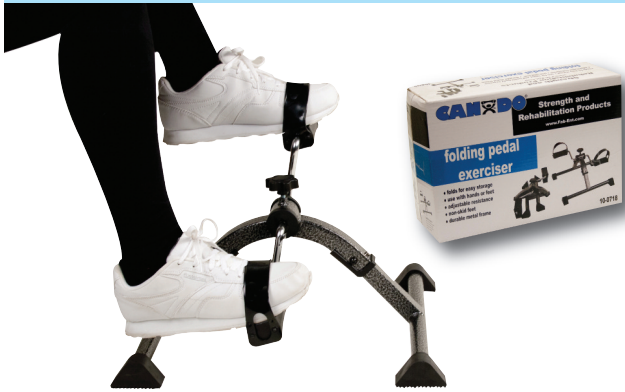
10-0718 folding pedal exerciser