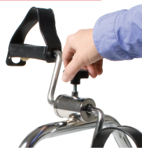
adjustable resistance knob