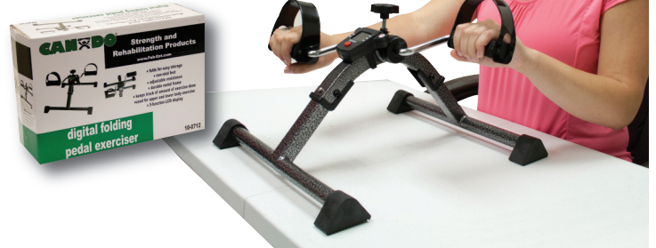
10-0712 digital folding exerciser