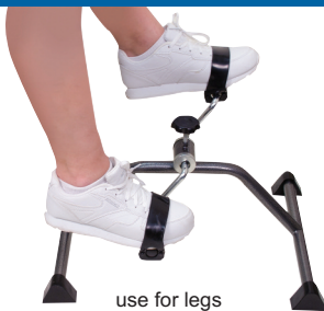
use for legs