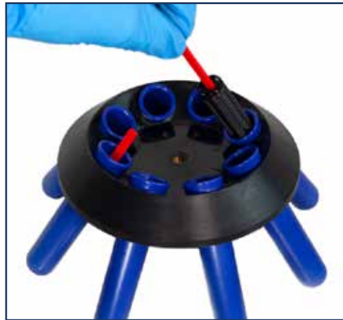
Insert the carrier in the blue tube sleeves.