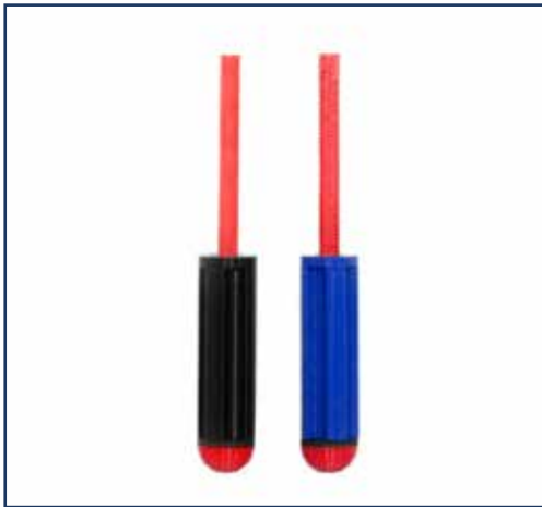
Insert capillaries in the Crit Carrier.