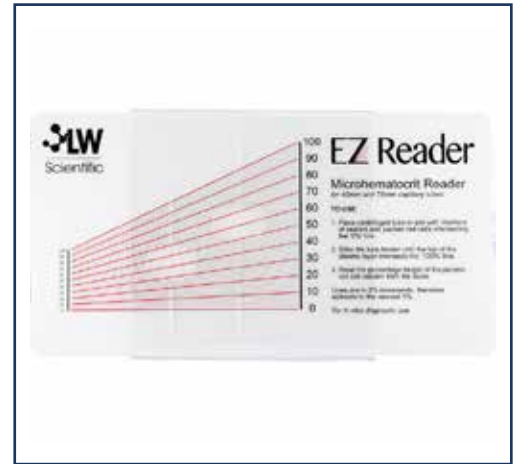
Spin at 3,500 rpm for 6 (+/-) minutes.