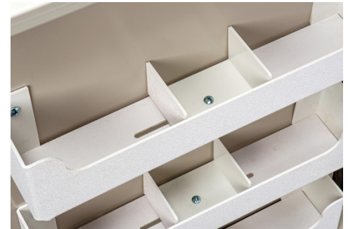
-610-3 Set of Three, 15.75" x 3" Open, Side Bins for left side of door