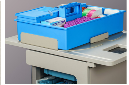
-612 Sliding Tray Holder 18.25" W adjusts from 8.25" to 13.5" D