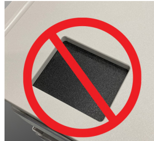
-611 No 4" x 5" Cutout —No Charge