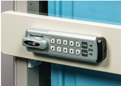
-601 Electronic Lock

NOTE: Electronic Lock not intended to secure narcotics or other restricted items.