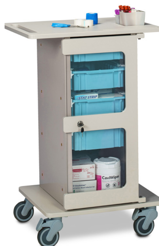
67-110with option 304 Three 3.5" Bins & One 5" Bin