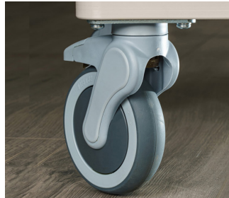
-602 Five inch Casters (upgrade from 4 inch)

NOTE: Electronic Lock not intended to secure narcotics or other restricted items.