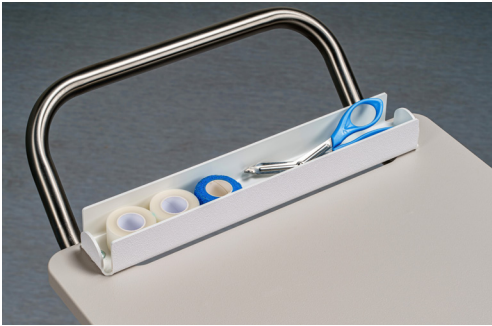
-617 One-Piece, Easy-Clean, Stainless Steel, Push Handle & Small Object Tray