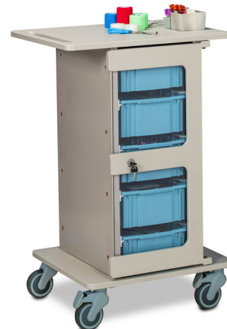
67-110with option 305 Four 5" Bins & One 3.5" Bin