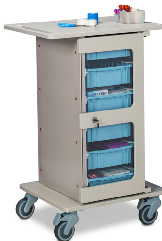
67-110with option 306 Six 3.5" Bins