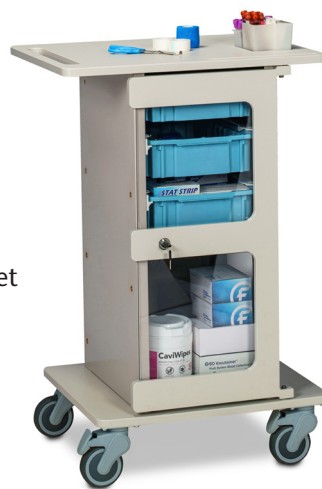
MODEL 67-110 Three 3.5" Bins