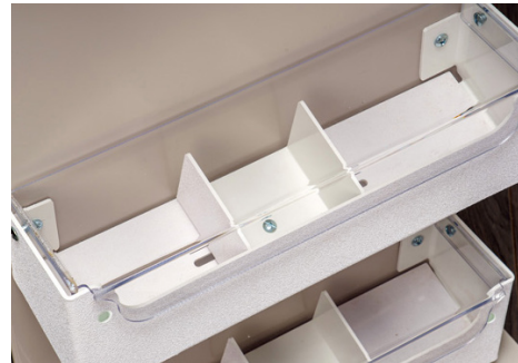
-608-3 Set of Three, 15.75" x 4" Clear, covered, Tilt-Lid, Side Bins for right side of door