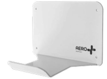
Item: Metal Wall Bracket Code: MWB01