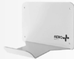
Item: Metal Wall Bracket Code: MWB01

This sturdy metal wall bracket keeps your backpack visible and ready for emergencies.