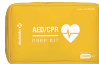
AED / CPR PREP KIT Code: CA-PK2US Case Included