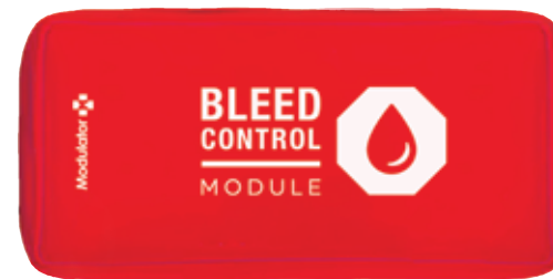
PRO BLEED CONTROL MODULE Code: M6009 Case Included