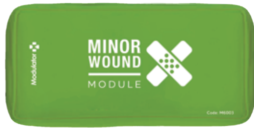
MINOR WOUND MODULE REFILL Code: M6003 Case Included