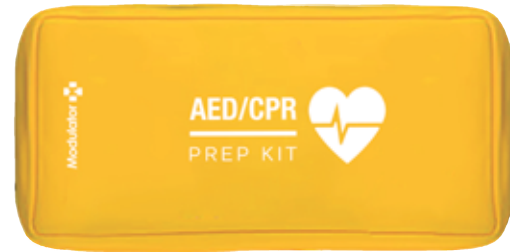
AED / CPR PREP MODULE Code: M6010 Case Included