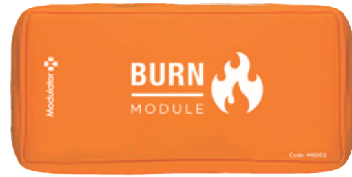
BURN MODULE REFILL Code: M6001 Case Included