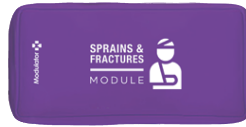
SPRAINS & FRACTURES MODULE Code: M6007 Case Included