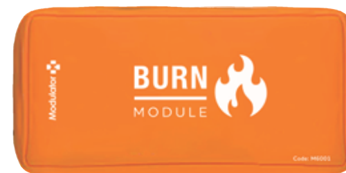
BURN MODULE REFILL Code: M6001 Case Included