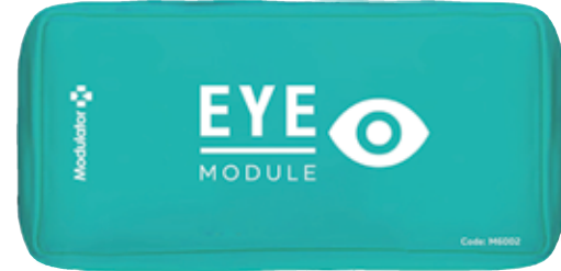
EYE MODULE REFILL Code: M6002 Case Included