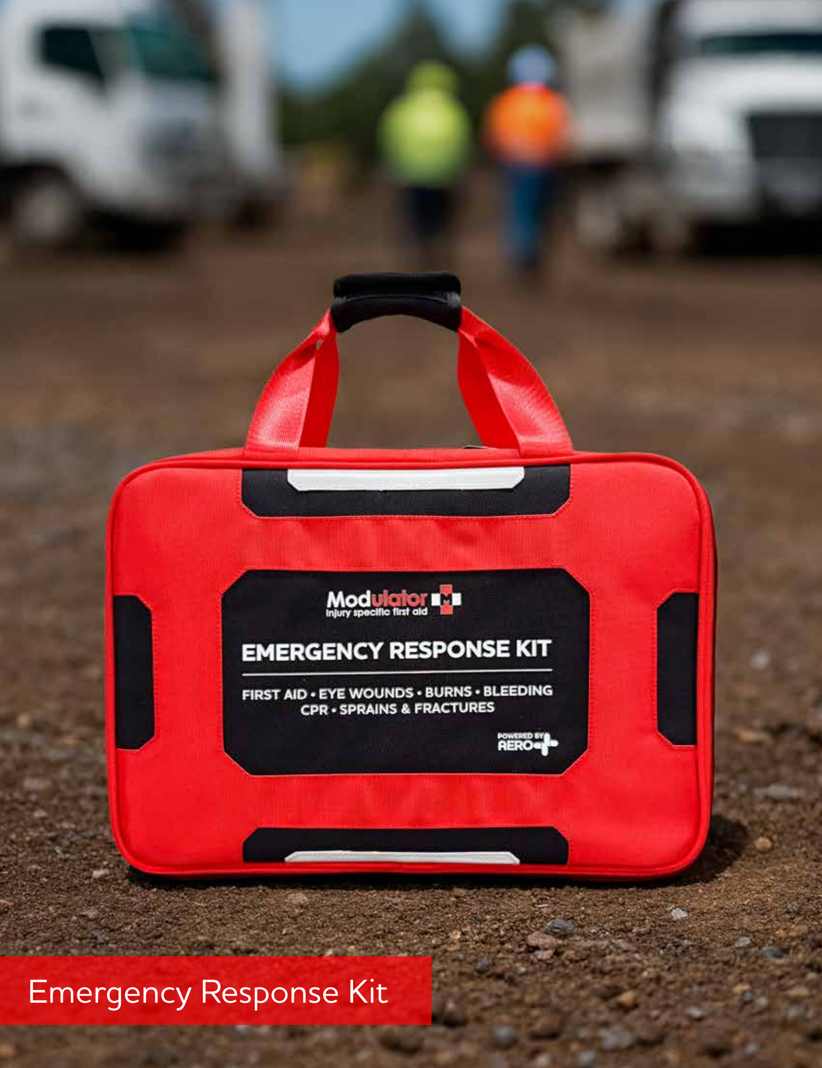
Emergency Response Kit