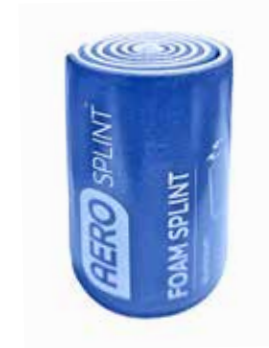
Item: Padded Splint Code: AR1060R Size: 24"L x 4.25"H