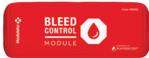
BLEED CONTROL MODULE REFILL* Code: M6005 Case Included