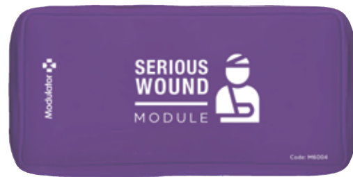
SERIOUS WOUND MODULE REFILL Code: M6004 Case Included