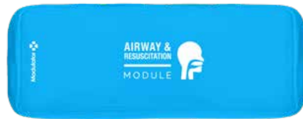
AIRWAY & RESUSCITATION MODULE Code: M6011 Case Included