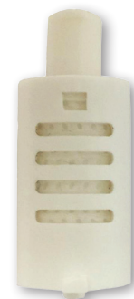
Water Filter T3