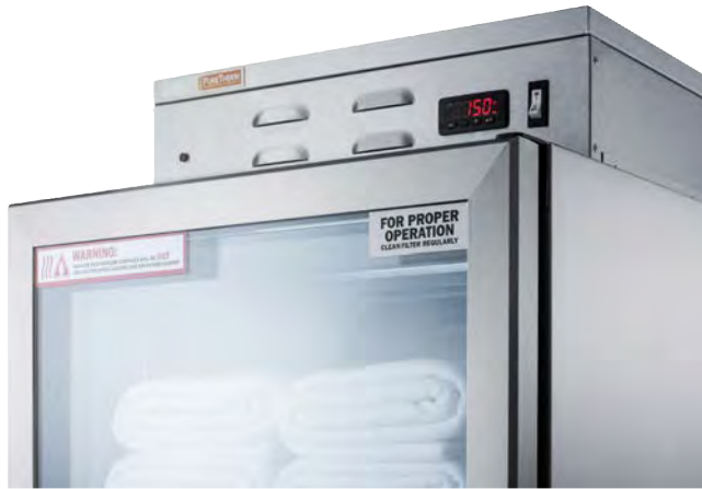
Stainless steel construction for lasting durability

Optional dollies available for easier mobility