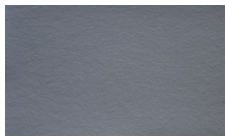
shale grey 10108480