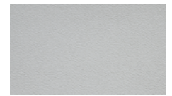
stone grey 10108520