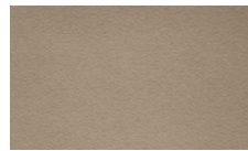
milky coffee 10108500