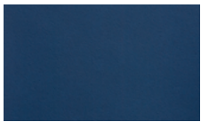
atlantic blue 10108470