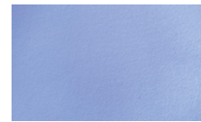
lavender purple 10108510