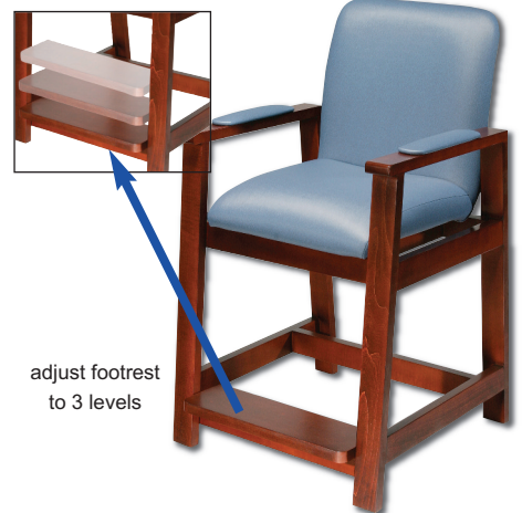
adjust footrest to 3 levels