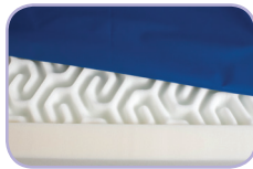
Dedicated extra soft convoluted heel section