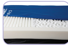
RF welded seams to prevent cross contamination