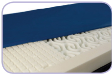
Specialized foam zones for optimal pressure redistribution