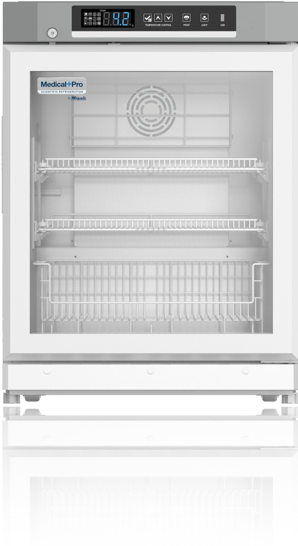
Medical Pro™ User interface