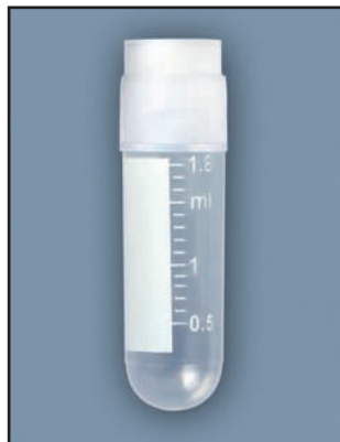
Item# 3011 (shown actual size)