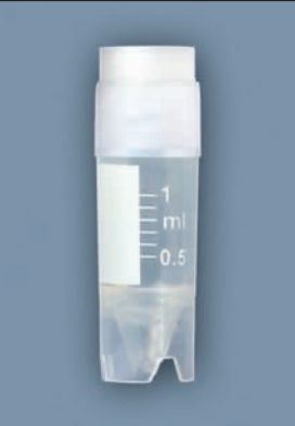
Item# 3010 (shown actual size)

All CryoClear<sup>™</sup> cryogenic vials are sold in tamper evident, resealable plastic bags. 50 vials per bag, 10 bags per case.