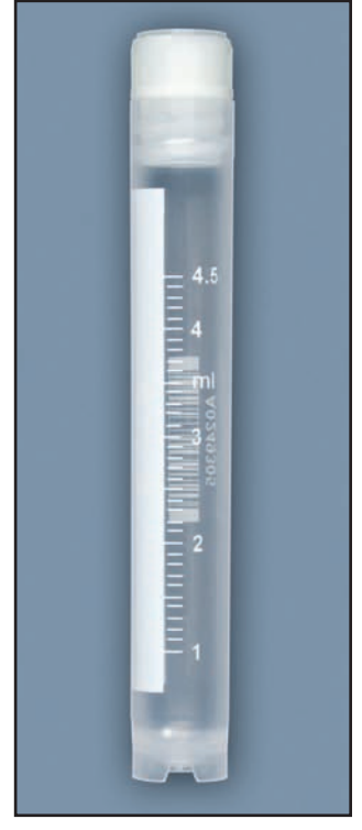
Item# 3008 (shown actual size)

All CryoClear™ cryogenic vials are sold in tamper evident, resealable plastic bags. 50 vials per bag, 10 bags per case.