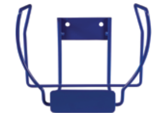
Item: Wall Bracket for HeartSine® AED Code: PAD-CAB-02