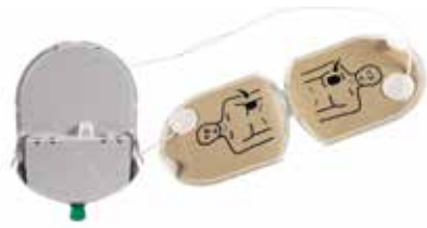
Item: Samaritan® Adult Pad-Pak (Grey) Code: PAD-PAK-01