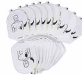
Item: HeartSine® AED Trainer Electrode Pcs: 10 Pack Code: TRN-ACC-02