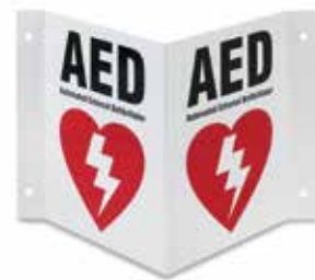
Item: AED 3 View Wall Sign Code: CA-01