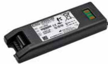
Item: LIFEPAK® CR2 AED Lithium Battery Code: 11141-000165