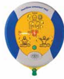
Item: HeartSine® SAM 450P AED Trainer Code: TRN-450-US