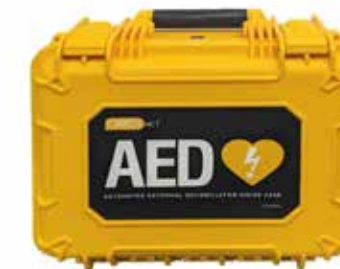
Item: CardiAct Rugged Watertight Carry Case, Yellow, fits Heartsine AED Code: CA-RG01