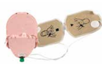
Item: Samaritan® Pediatric Pad-Pak (Pink) Code: PAD-PAK-02