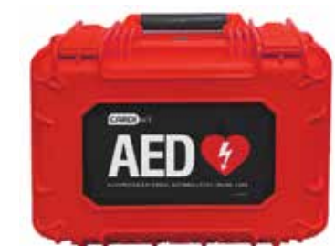
Item: CardiAct Rugged Watertight Carry Case, Red, fits LIFEPAK CR2I Code: CA-RG02