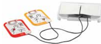
Item: LIFEPAK® CR2 Training Electrode Tray Code: 11250-000145