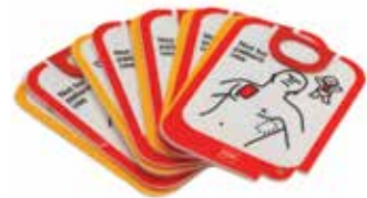
Item: LIFEPAK® CR2 Trainer Electrode Pcs: 5 Pack Code: 11250-000140