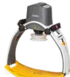
Item: LUCAS 3.1 Chest Compression System Code: 99576-000063