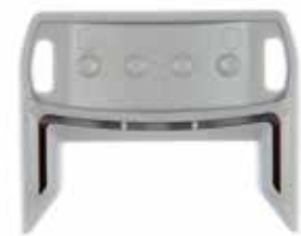
Item: HeartSine® Gateway Removal Tool Code: ACC-REM-GW