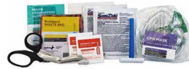
Item: CardiAct™ AED Premium Prep Kit Module Code: CA-PK3US