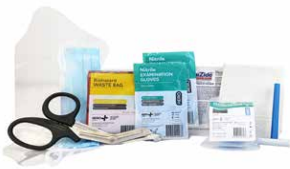
Item: CARDIAC™ AED Prep Kit in Plastic Bag Code: AED-PK2US