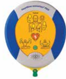
Item: HeartSine® SAM 350P AED Trainer Code: TRN-350-US