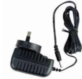
Item: HeartSine® Trainer Battery Charger Code: TRN-ACC-14