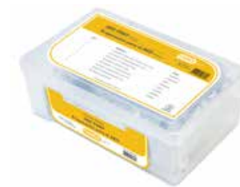
Item: CARDIAC™ AED Premium Prep Kit Module Code: CA-PK3US