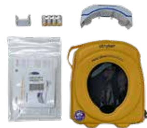
Item: HeartSine® Gateway, Gateway Carry Case, US English Code: ACC-GTW-US-01