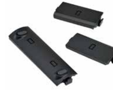
Item: LIFEPAK® CR2 AED Trainer Battery Covers Code: 21250-000003