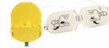
Item: HeartSine® AED Trainer Electrode Cartridge Code: TRN-ACC-04