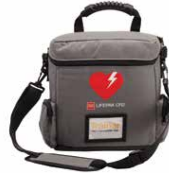
Item: LIFEPAK® CR2 Trainer / Demo Bag Code: 11260-000048