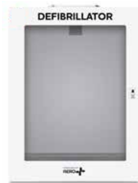
Item: Defibrillator Wall Cabinet - Alarmed Code: AEKM05