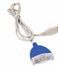
Item: HeartSine® Samaritan® PAD USB Cable Code: PAD-ACC-02