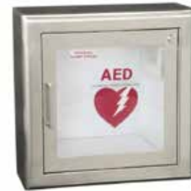
Item: Stainless Steel Recessed AED Wall Cabinet Code: 1436-F12