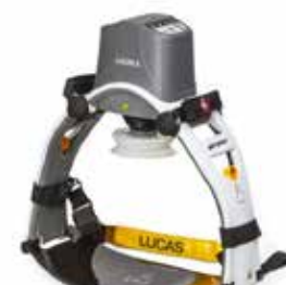
Item: LUCAS 3, 3.1, TRAINING UNIT, EN Code: 99576-000083