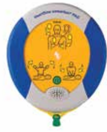
Item: HeartSine® SAM 360P AED Trainer Code: TRN-360-US