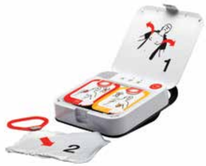
Item: LIFEPAK® CR2 QUICK-STEP Electrodes Pack Code: 11101-000021