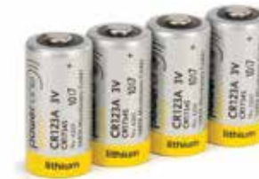
Item: HeartSine® Gateway Replacement Batteries (4x CR123a) Code: ACC-BAT-GW