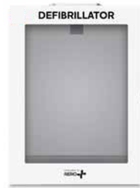
Item: Defibrillator Wall Cabinet Code: AEKM04