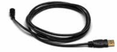
Item: LIFEPAK® CR2 Replacement USB Cable Code: 21300-008143