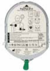
Item: Samaritan® Aviation Pad-Pak Code: PAD-PAK-07