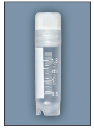
Item# 3002 (shown actual size)