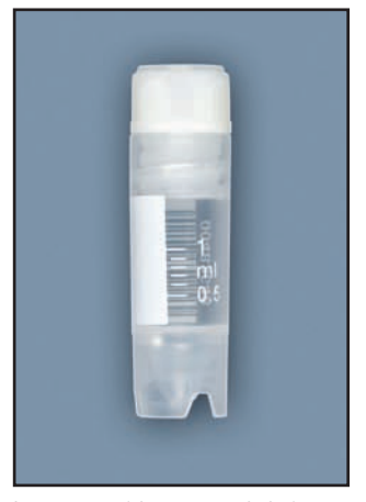
Item# 3001 (shown actual size)