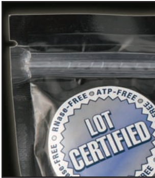
All CryoClear<sup>™</sup> cryogenic vials are sold in tamper evident, resealable plastic bags. 50 vials per bag, 10 bags per case.