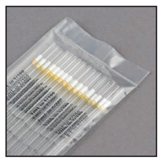
1710 - Sterile, bulk pack 1715 - Non-sterile, bulk pack