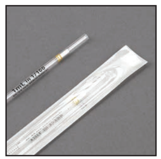
1700 - Sterile, individually wrapped