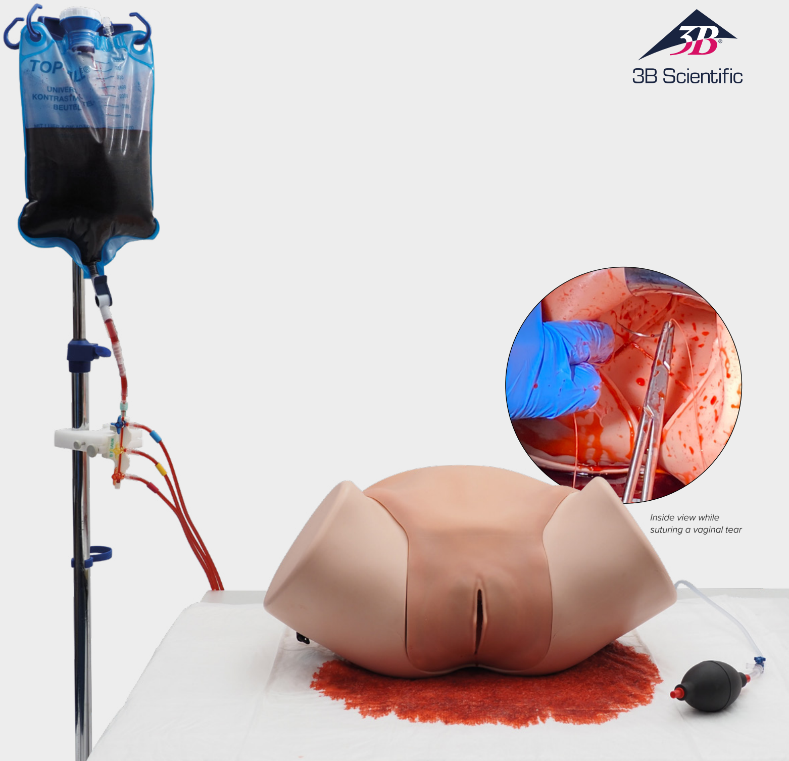
Inside view while suturing a vaginal tear