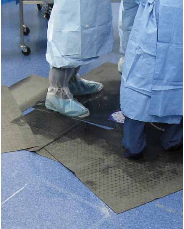
PIG Surgical Absorbent Mat won't bunch up like hospital blankets.

WARNING: Used absorbents can take on the hazardous characteristics of liquids absorbed. Follow local, state and federal regulations when storing or disposing of used absorbents.