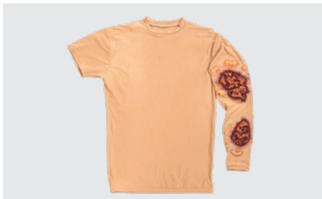
Full Thickness Arm Burns