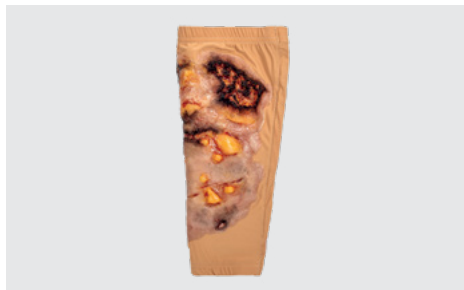
Full Thickness Leg Burns