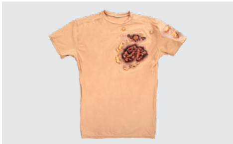
Full Thickness Burns (Chest and Back)