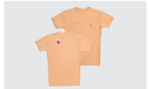
Sucking Chest Wound + Exit Back