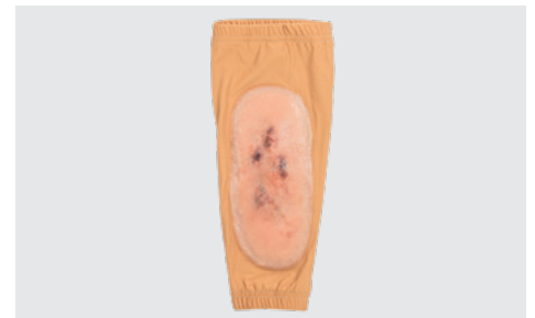
Closed Tib Fib Fracture