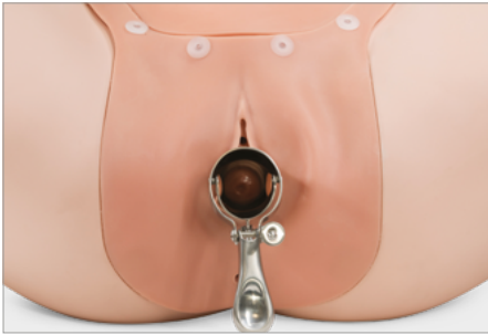
Train vaginal examination and visual recognition of normal and abnormal cervixes