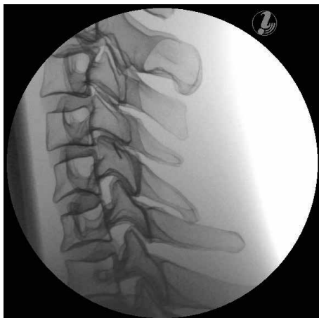
Intraarticular facet from lateral