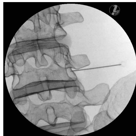
Transforaminal Epidural Steroid Injection (TFSI) ap view