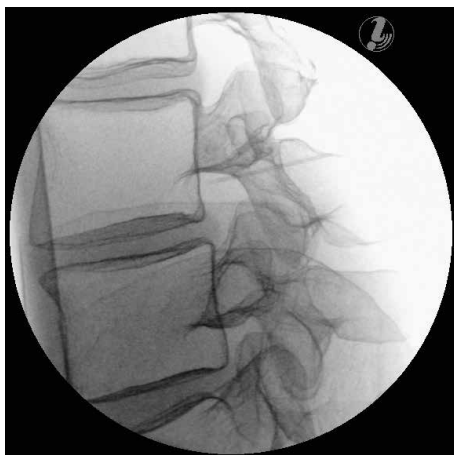
Transforaminal Epidural Steroid Injection (TFSI) lateral view