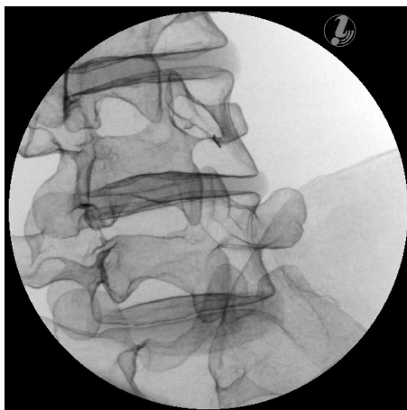
Transforaminal Epidural Steroid Injection (TFSI) oblique view