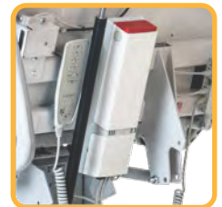
On-Board Charging Lithium-ion Battery