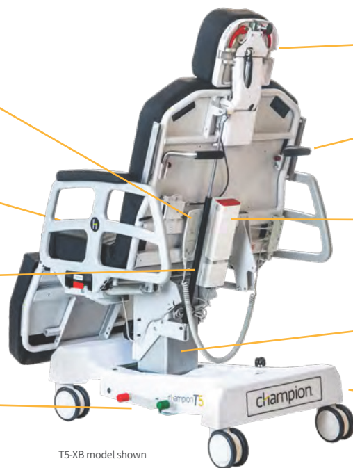
T5-XB model shown

The T5 Procedure Chair embodies our One Patient, One Surface® philosophy: Each patient remains on one surface throughout their visit—comfort, safety, efficiency, and functionality combined! One piece of equipment also means cost savings, space savings, and time savings. Invest in a procedure chair that puts patients first and affords precise positioning for surgeons, easy access for caregivers, and smoother transport for medical staff