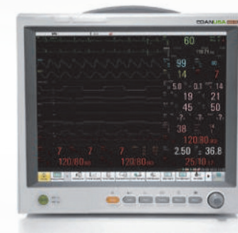
elite V8 Patient Monitor

The various interfaces and LAN/Wi-Fi compatibilities of the elite V8 enable healthcare providers to monitor their patients' health status from almost anywhere. Connecting it with EDAN MFM-CMS central monitoring system, you may log on from anywhere via your PC/tablet/smart phone, and check the status of your patients. Using its HL7/XML features, you may even build a seamless connection to the hospital information system.