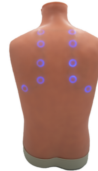
Illuminated auscultation sites.