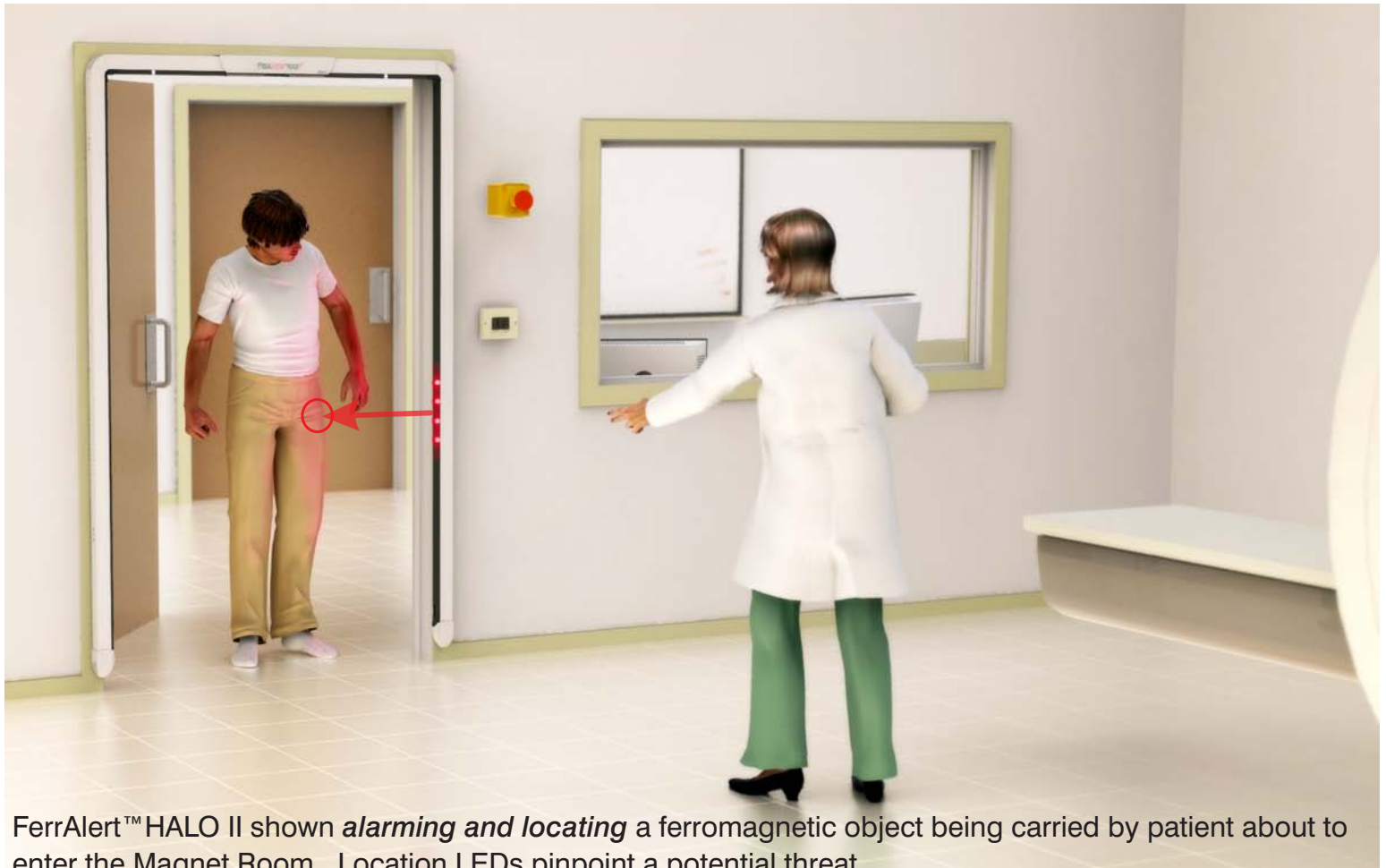
FerrAlert™ HALO II shown alarming and locating a ferromagnetic object being carried by patient about to enter the Magnet Room. Location LEDs pinpoint a potential threat.

Unlike other detectors, ONLY FerrAlert™ allows the Technologist to have full control of the MRI room when working inside and can quickly pinpoint the location of the ferromagnetic threat.