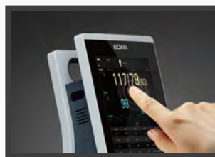
8" Color TFT Touch Screen