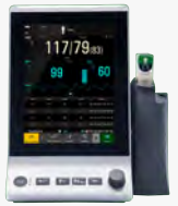
Quick Oral Temp iM3_NST.O