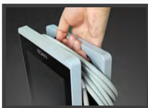
Lightweight, Ultra Slim Design