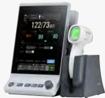
Non-Contact Temp iM3_NST.HTD