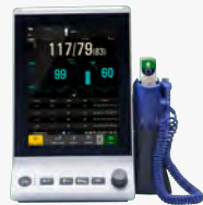
Covidien Oral Temp iM3_NST.C