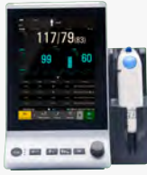
Infrared Ear Temp iM3_NST