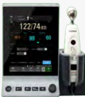
Exergen Temporal Temp iM3_NST.E