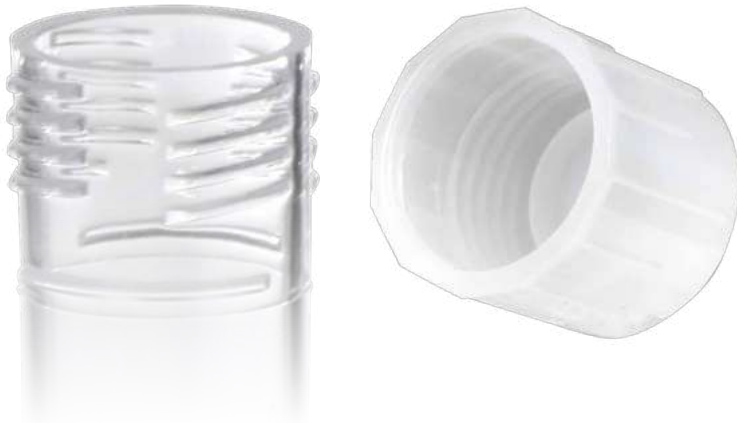
Patented thread and cap design