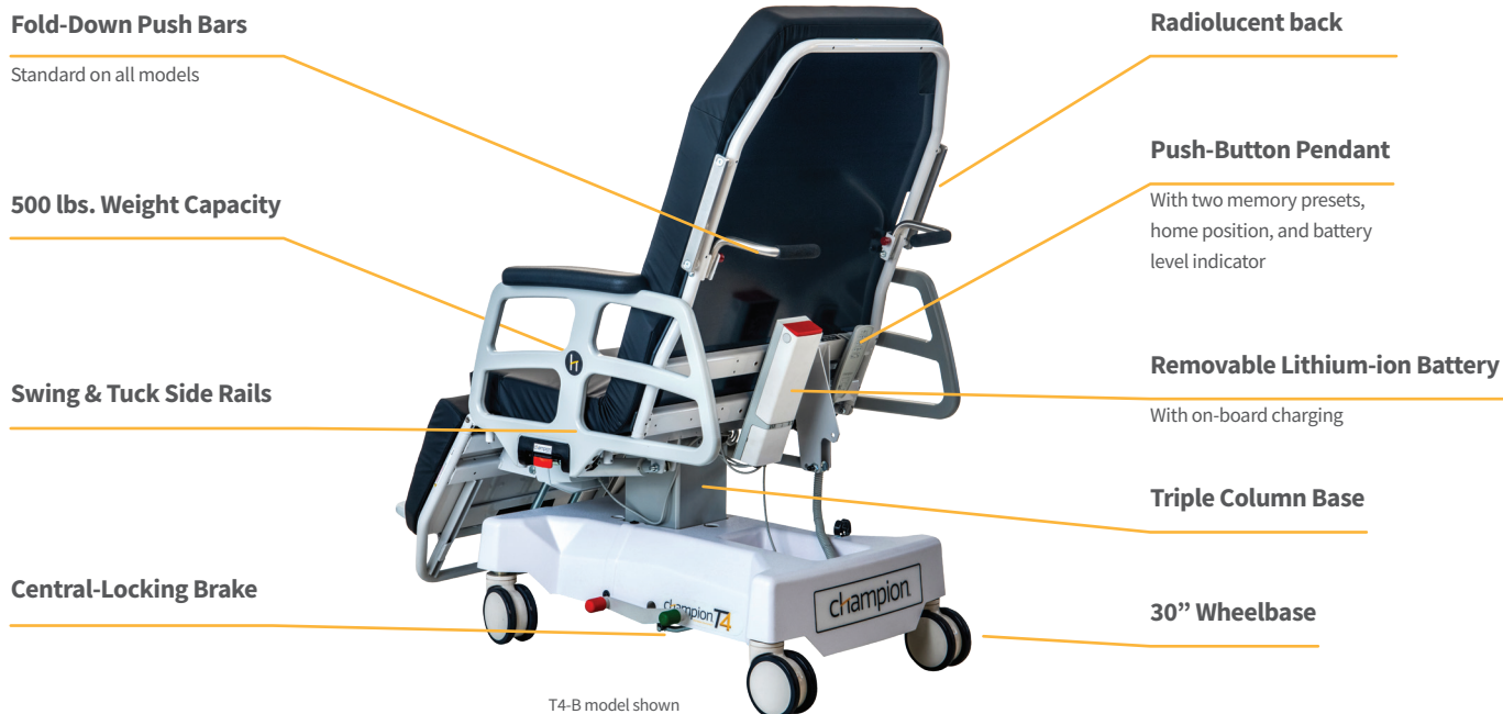
T4-B model shown

The T4 Procedure Chair embodies our One Patient, One Surface® philosophy: Each patient remains on one surface throughout their visit—comfort, safety, efficiency, and functionality combined! One piece of equipment also means cost savings, space savings, and time savings. Invest in a procedure chair that puts patients first and affords precise positioning for surgeons, easy access for caregivers, and smoother transport for medical staff.