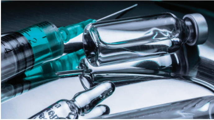
Vaccine & Pharmaceuticals