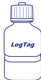
Buffer assembly Not Included (Silica sand recommended for temperatures below -40^{\circ}\text{C} )