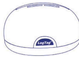
LTI HID Not Included