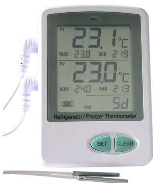
Monitor... 2 Ultra Low Freezers