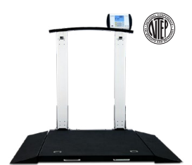
6560 Series Wheelchair or Standing Scale with Curved Handrail