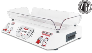
6745 Digital Baby Scale