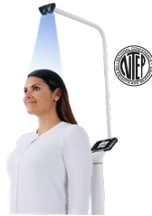
ICON Series Column Scales with Sonar Height Rod