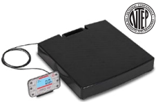
APEX-RI Series Low-Profile Physician Scales