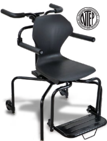
6880 Series Rolling Chair Scales