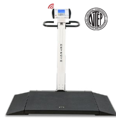
6550 Series Wheelchair Scales with Column-Mounted Indicator