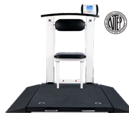
6570 Series Wheelchair, Seated, or Standing Scale with Handrail