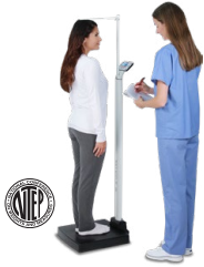
APEX Series Column Scales with Mechanical Height Rod