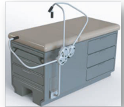
Exam Table/Chair Mount

All models are sold complete with light and flex-arm system. (Product images not to scale.)