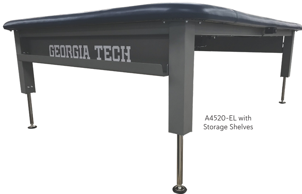
A4520-EL with Storage Shelves