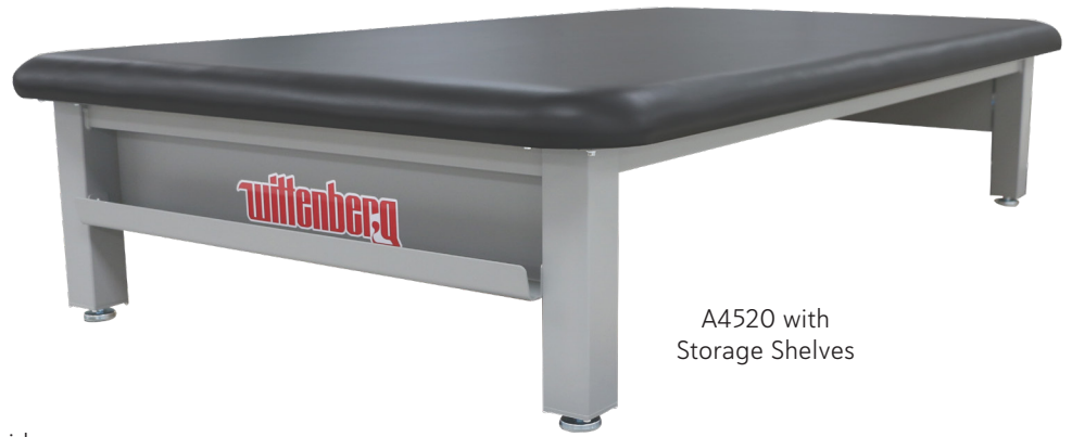
A4520 with Storage Shelves