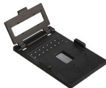
SmartDrop™ Accessory Plate