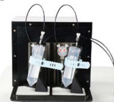
Automatic Injection Module

The SmartReader Multimode is capable of luminescent detection and can process both flash and glow assays. An advanced PMT (photo multiplier tube) enhances sensitivity of weak signals, prevents over-saturation of strong signals, and provides an ideal detection range for all common luminescence applications. Up to 2 sample injectors (optional) can be installed and are compatible with both 96 and 384-well plates.