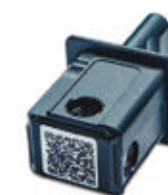
Fluorescence Filter Module

Three filter modules are included to provide the most common excitation and emission wavelengths needed for fluorescence assays. Additional filter modules are available. These advanced modules incorporate dichroic mirrors with narrow band-pass optical filters and ensure high light transmission, increased detection sensitivity, and are easily exchanged. Modules are barcoded for automatic loading of wavelength data. The SmartReader Multimode allows for automatic dynamic range selection, which allows for the gain of the photomultiplier tube to accurately capture and normalize the signal intensity of samples.