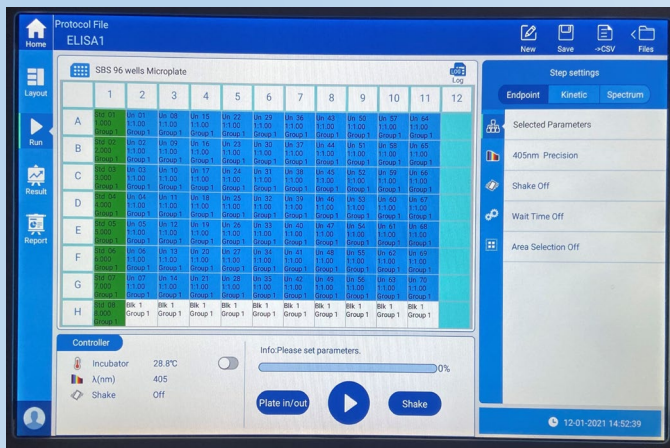
96-well Plate Layout Screen