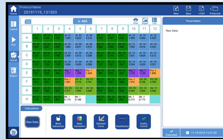
96-well Reading Result Screen