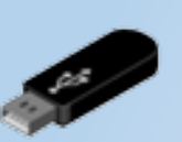
Data Transfer via USB