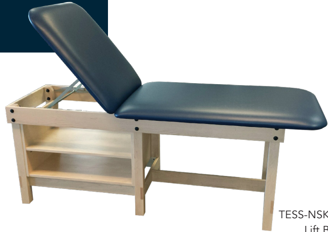
TESS-NSK100 with Lift Back