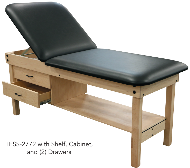
TESS-2772 with Shelf, Cabinet, and (2) Drawers