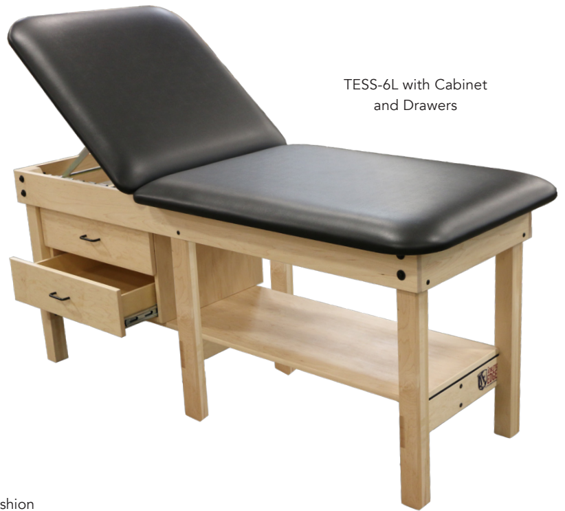
TESS-6L with Cabinet and Drawers