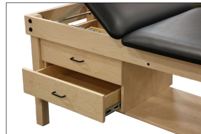
Shelf, Cabinet & (2) Drawers with Black Wire Pull Handles

TESS-6LS - Lift Back, Split Leg Cushion 30"W x 78"L x 31"H