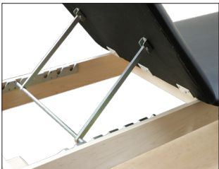
Manual Lift Back with 6 Position Elevation